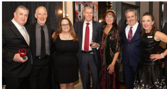
The Green Lizard Foundation